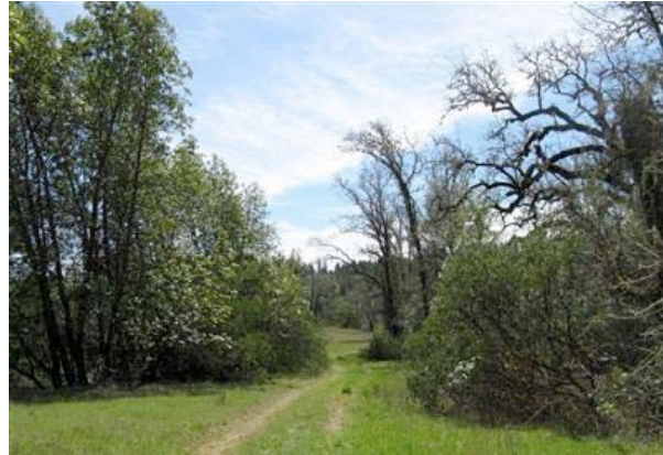
Walking south toward town

The Golden State Land Conservancy has taken the initiative to promote efforts to open a “managed multi-use trail” between the Brooktrails Township and the City of Willits. There is currently only one travel connection between Brooktrails and Willits—Sherwood Road. Sherwood Road is dangerous, and was built only for car and truck traffic. Most pedestrians and bicyclists cannot safely travel between these two very close and interdependent communities. This steep narrow country road has no bike lane or pedestrian path and can only be used safely by vehicles. Long-time residents know that another trail once connected Willits and Brooktrails for hikers and bicyclists. This historic trail if pursued, would allow pedestrians, bicyclists, and equestrians safe travel between the two communities.