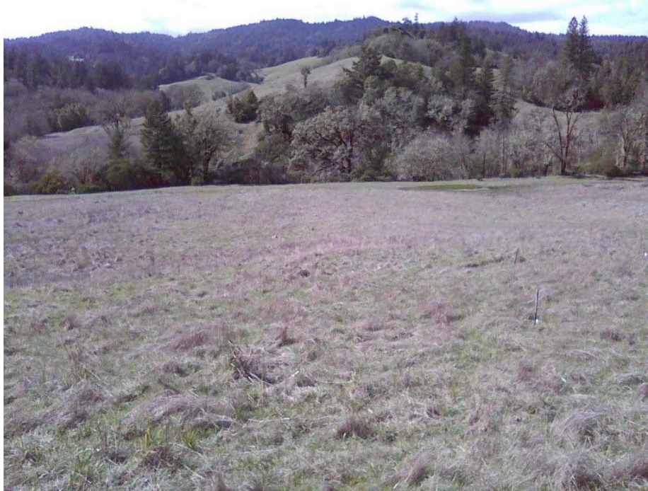
Looking west from the native grassland toward the oak woodland and redwood forest of the coast range, with the Pathway meandering along the edge of the trees.

The Willits Creek Pathway concept is a way to enjoy nature and its beauty while eventually connecting Brooktrails Redwood Park and its many miles of open trails with Willits' schools and services in a safe and manageable way.